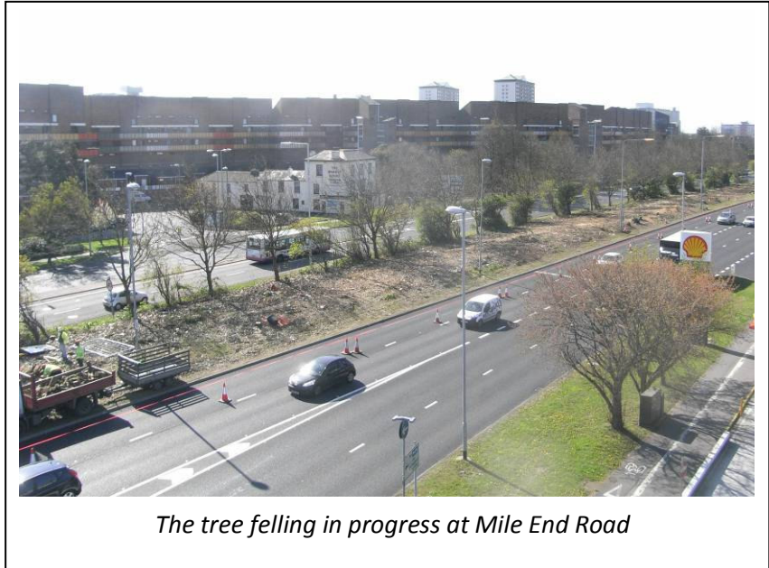
The tree felling in progress at Mile End Road

The road building will take eight months after which southbound traffic will be able to turn right onto the new link road. Whilst some tree felling to create the scheme was inevitable, we feel that the wholesale destruction was not. We are told that there will be re-provision but have no knowledge of where and when. It is doubly upsetting for the felling took place in the springtime when the flora and fauna was emerging from the long winter.