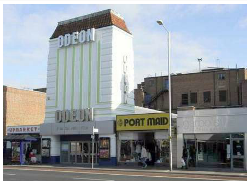
The Odeon Cinema, North End, 1936 - 2008

We were very disappointed to see closure of the Odeon Cinema in North End which showed its last film on 10 January. Despite its being in the centre of Portsmouth, filmgoers will now have to travel to Gunwharf or Port Solent. With the site sold we can expect to see a planning application in the coming months and we urge the new owners to keep the distinctive tower on London Road and incorporate it into their plans. The large site, which includes a car park, could allow a road to be constructed linking Stubbington Avenue with Laburnum Grove and providing service access to the parade of shops.