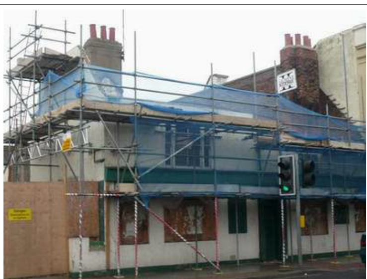
The former Guardsman Public House, in Fratton Road with its temporary roof covering.