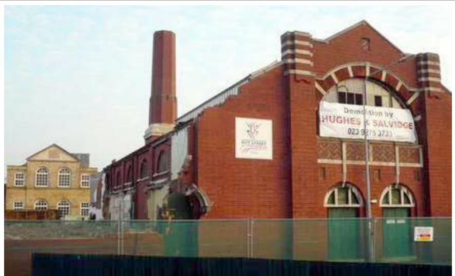
The replica facade of the Bell School is revealed during the demolition of Pitt Street Baths

After a long history of ups and downs, Pitt Street baths were suddenly and quickly demolished in January 2008. This L-shaped Art Nouveau building was built in 1910-11 as the Royal Naval School of Physical Training at a time when the armed services were worried about the lack of fitness of new recruits. It has a twin in Chatham, in HMS Pembroke, now used by the University of Greenwich. In the early 1990s the building was the focus of one of the Portsmouth Society's biggest struggles and its greatest triumph.