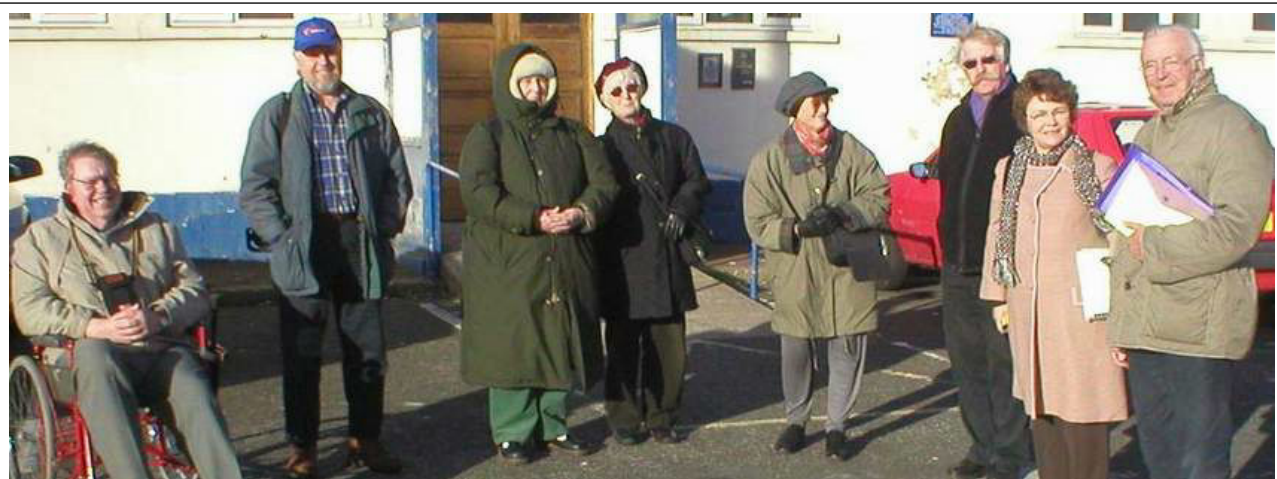
Hilsea Lido supporters pictured outside the Blue Lagoon in March 2007

The Portsmouth Society brokered the formation of a new community group which was formed last October in response to the Council's decision no longer to fund the continued opening of Hilsea Lido swimming pool from the end of the 2008 season - a season that as such, only lasts for the duration of the school's summer holiday anyway!