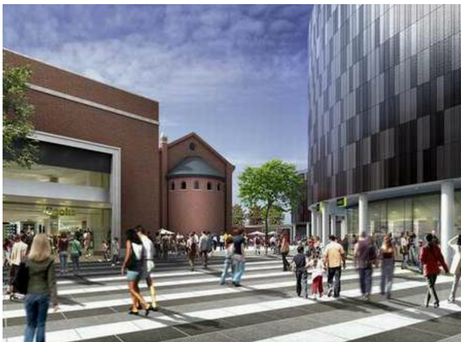
Artist's impression of the Central Piazza with the new M&S store to the right and St Agatha's church in the centre.

The developers (Centros Miller) who now own or are negotiating to buy the site of the Tricorn, the northern end of the Commercial Road precinct and the beginning of Lake Road held a public exhibition of their massive scheme for 3 days in March-April 2007 at The Haven in Lake Road. We studied the models and perspectives and welcomed the opportunity to talk to the developers' representatives and the architects of some of the proposed buildings.