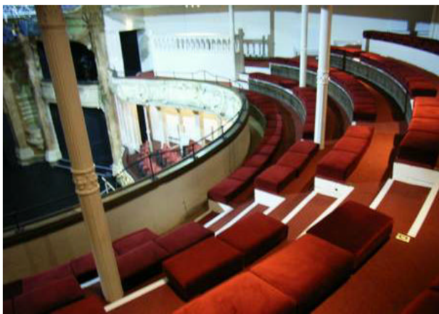
Best Restoration : The New Theatre Royal, showing the restored Upper Circle