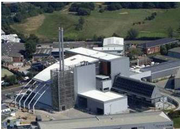
The Incinerator, Quartermaine Road.