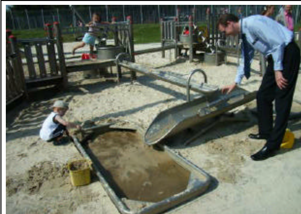
Joint Best Landscaping : Inside/Outside Playground, Marsden Road, Paulsgrove