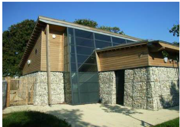
Waterside School, Tipner Lane, joint winner in the Best New Building category