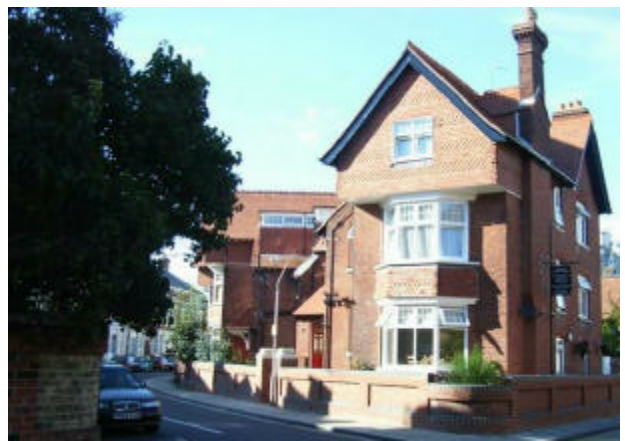
Commended : The Florence House Hotel, Malvern Road, Southsea

creation of a beautiful boutique hotel in what had been a shabby bed and breakfast. We were also impressed by Portsmouth Grammar School's new library and Ken Woolas laboratory, designed by Hampshire County Architects' Department.