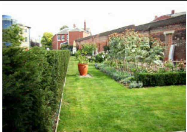
Joint Best Landscaping : Porter's Garden, Dockyard Heritage Area