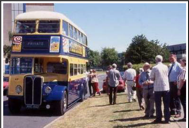
Members board the bus in Lake Road after visiting the Charles Dickens Community Centre