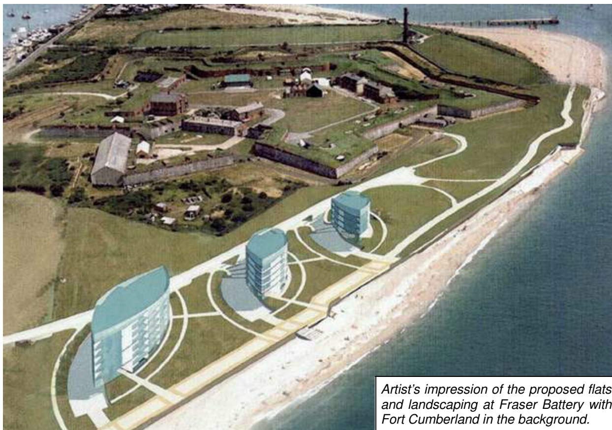
Artist's impression of the proposed flats and landscaping at Fraser Battery with Fort Cumberland in the background.

QinetiQ, a privatised part of the MOD, the new owners of Fraser Battery had a welcome open weekend in April when local people had a chance to explore this special part of Portsmouth's coastline and consider its future. Its history including fortification, a naval test battery firing missiles out to sea, and research base is still apparent. QinetiQ's scheme is to clear the site – of the two masts, office/laboratory building, sheds, perhaps keeping one gun emplacement or two, and redevelop it as three blocks of flats from seven stories down to four. The Society says that the redevelopment should not obliterate the site's history, but celebrate it, retaining some of these features in future plans for the site, rather than clearing it to a 'blank sheet'. The outline planning application has now been lodged.