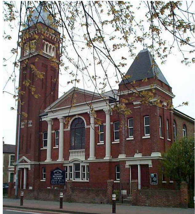
Trinity Methodist Church, Albert Road, Southsea - too large for its' current congregation?

In the main, it falls to the local congregation to raise the funds. In the Church of England, the central funds of the Church Commissioners are taken up with providing pensions for the retired clergy, supporting to some extent the Cathedrals and financing the central organisation of the Church. Many local congregations have to struggle to survive.