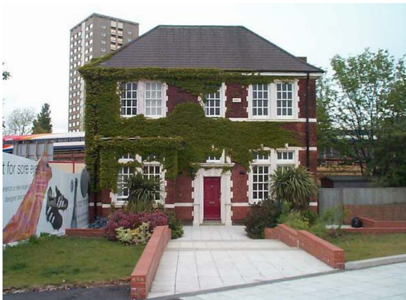
Donegal Lodge, Gunwharf - under threat of demolition once more.

Last October two further planning applications were published for buildings on Gunwharf Quays to occupy the undeveloped south eastern quarter of the site. There were to be two large buildings mainly of flats containing a total of 465 dwellings, each with a tower, and involving the demolition of Donegal Lodge, the former commanding officer's residence and the one remaining heritage building.