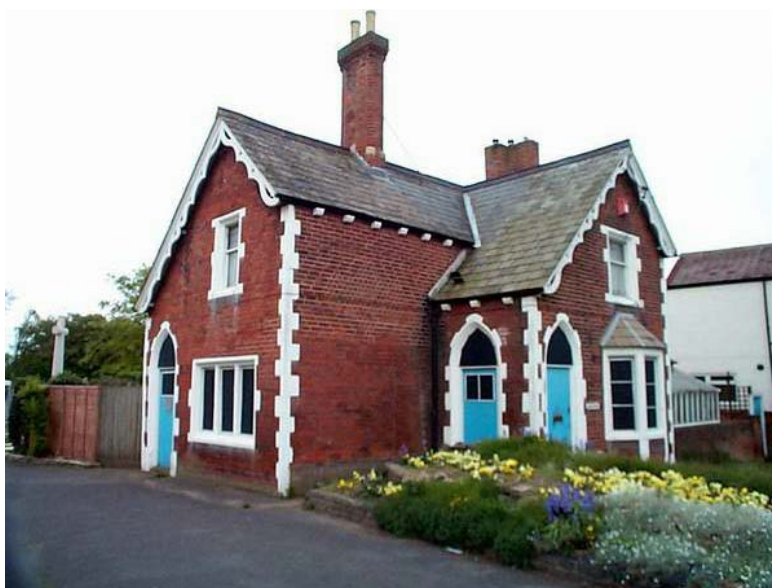
Superintendent's Lodge, Highland Road Cemetery.