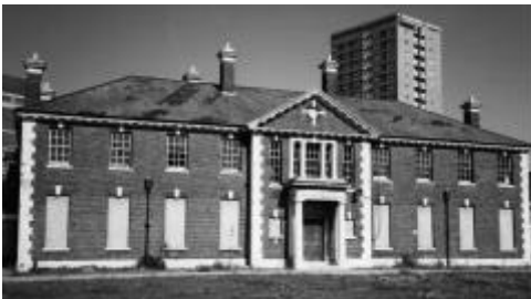
The Wardroom at HMS Vernon