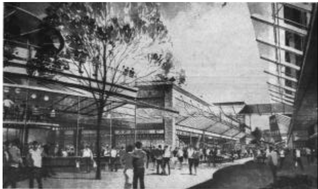
The proposed new Tricorn viewed from Charlotte Street - no better than before.

A new application has been submitted for a replacement building for the Tricorn containing large and small shops, car parking, a restaurant and a large leisure space which the promoters are hoping to include an 8-screen cinema and failing that bowling etc. The scheme is likely to go before the planning committee on Wednesday 18 September. Objections will be accepted up to the week before that. The executive committee's decision has not yet been made; but it is likely that we shall object on architectural grounds that the design is not absolutely first class.